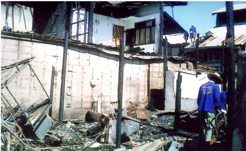
Left, the students' burnt-out house, the day after the fire.