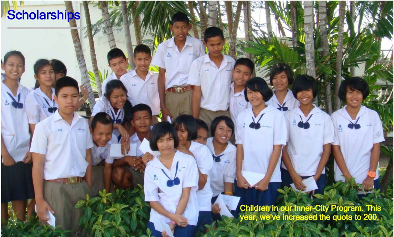
Children in our Inner-City Program. This year, we've increased the quota to 200.