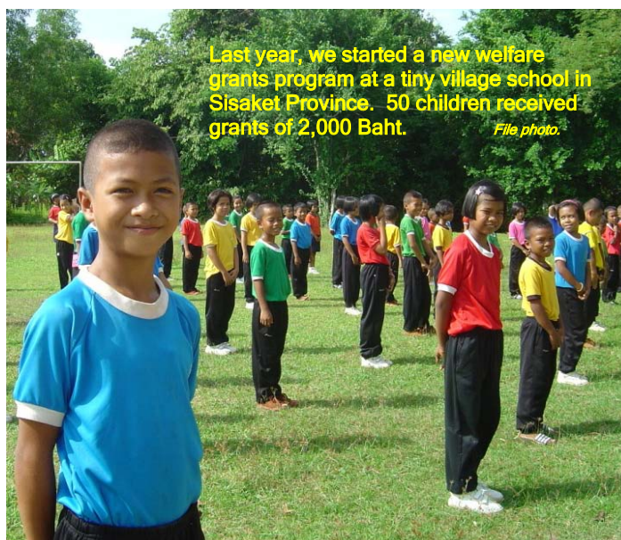
Last year, we started a new welfare grants program at a tiny village school in Sisaket Province. 50 children received grants of 2,000 Baht. File photo.