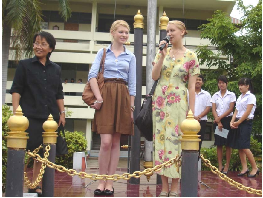
It's a nerve-wracking experience when the volunteers have to introduce themselves at their first morning assembly to more than 4,000 students at the vocational college.

Although the girls try to make learning and using English as